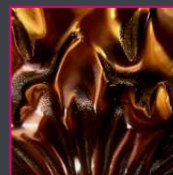
OB (Oil-rubbed bronze)