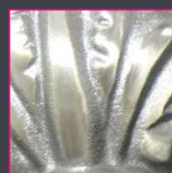
AB (Antique Bronze)