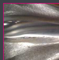
NM (Nickel matte)